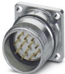
Device connector for front wall, straight, shielded: yes, Screw locking, M23, No. of pos.: 7, type of contact: Pin, Crimp connection, Axial O-ring, 4x Ø 3.2

Please be informed that the data shown in this PDF Document is generated from our Online Catalog. Please find the complete data in the user's documentation. Our General Terms of Use for Downloads are valid ( http://phoenixcontact.com/download )