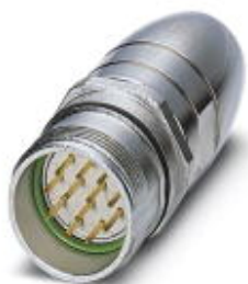
Coupling connector, straight, shielded: yes, Screw locking, M23, No. of pos.: 8+1, type of contact: Pin, Solder connection

Please be informed that the data shown in this PDF Document is generated from our Online Catalog. Please find the complete data in the user's documentation. Our General Terms of Use for Downloads are valid ( http://phoenixcontact.com/download )