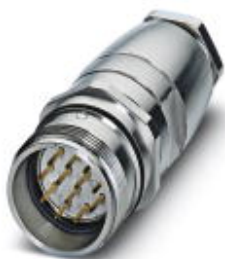
Coupler connector, with Pg11 connection thread, straight, shielded: no, Screw locking, M23, No. of pos.: 12, type of contact: Pin, Solder connection, cable diameter range: 8 mm ... 12 mm

Please be informed that the data shown in this PDF Document is generated from our Online Catalog. Please find the complete data in the user's documentation. Our General Terms of Use for Downloads are valid ( http://phoenixcontact.com/download )